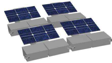
Fig. 2. The floating design

This concept was proposed by WavEC company (Fig.2) [4].